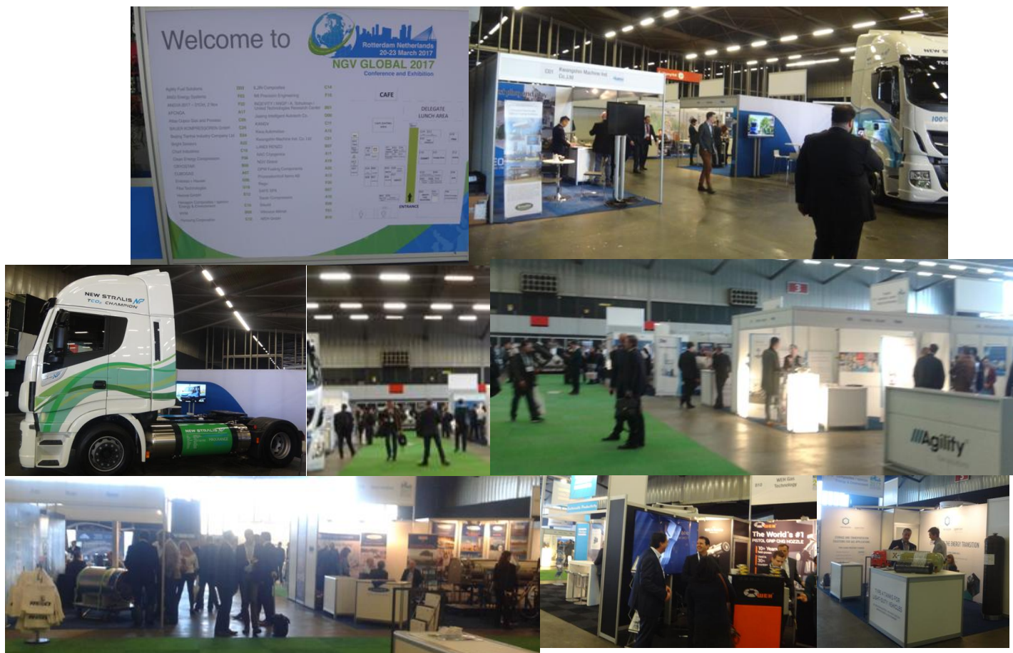
Top: At the Exhibition