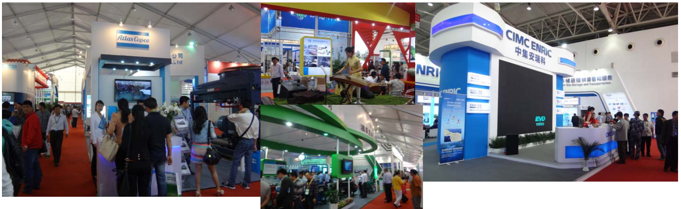
Top: Exhibits inside the halls