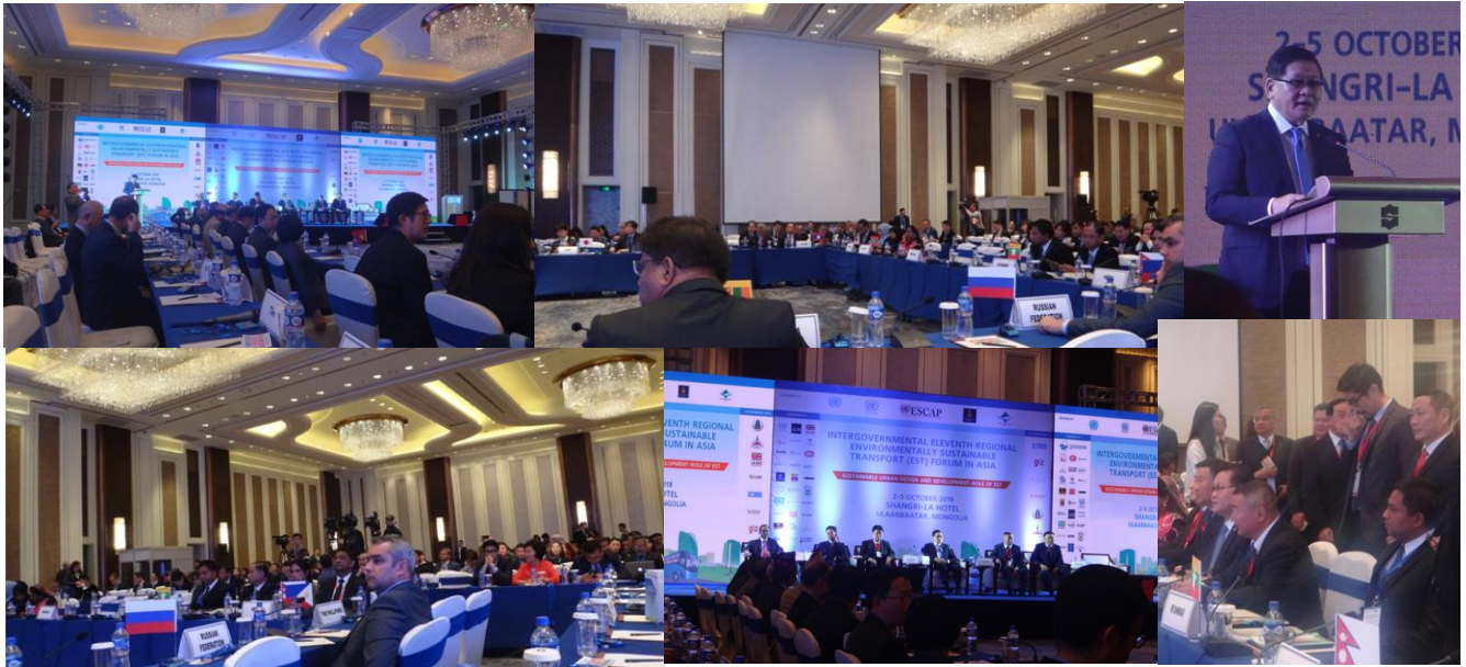
Top: At the official opening of the 11 EST by Deputy Prime Minister of Mongolia