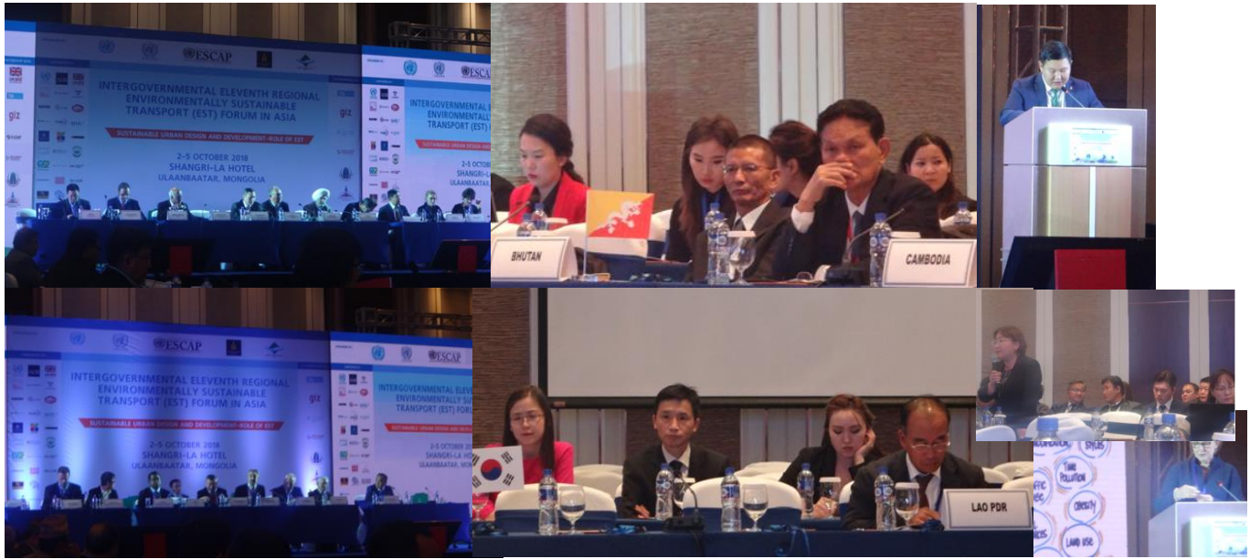
Top: At the main EST forum