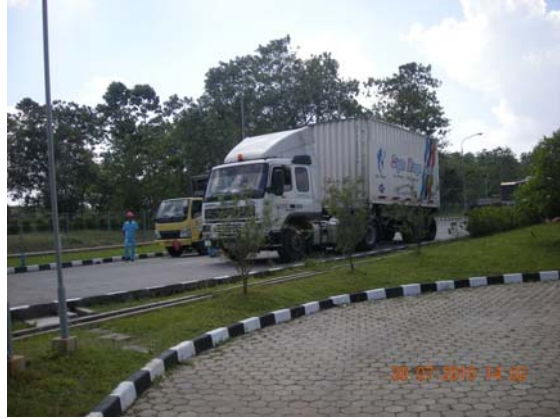
Different sizes of trailers delivering CNG from Mother Station