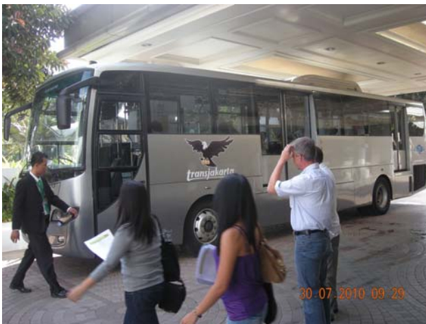
TransJakarta CNG Bus for the Technical Tour

On Friday, 30 th July 2010, a technical tour to 3 mother stations were organised by the Organiser. Delegates were taken to the 3 CNG mother stations using the CNG Bus from TransJakarta BRT Operator. All 3 mother stations are currently supplying CNG via trailers to industrial customers as at present there are no NGV daughter stations in operation in Jakarta. However, these 3 mother stations are ready to supply CNG to NGV daughter stations when the need arises and when the price mechanism are clear and established and enough margins are provided for the operators of both mother and daughter stations.