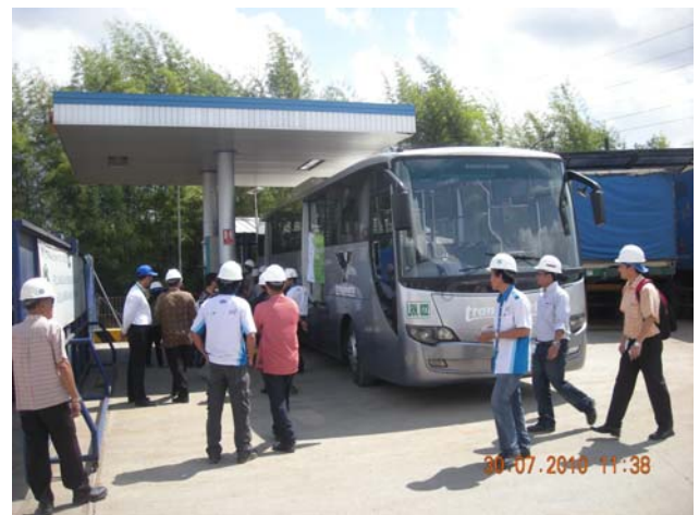
CNG Bus Refuelling as the Mother Station