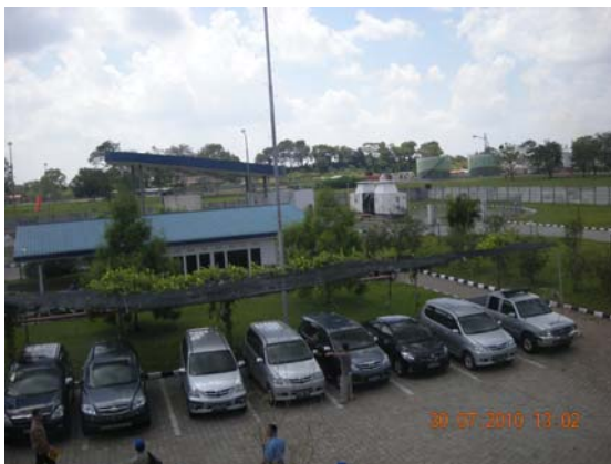
Filling bay and Compressors in background