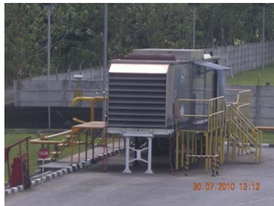
Mobile Refuelling Unit