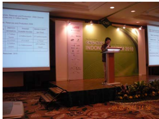
One of Speaker giving presentation