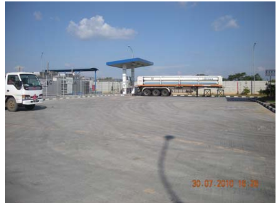
View of compressors and trailer filling bay