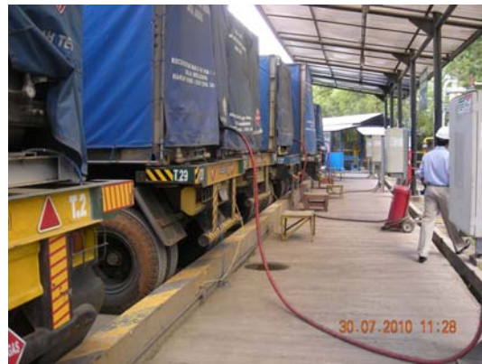
Rows of trailers being filled with CNG