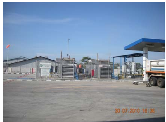
View of trailers, compressor and trailer filling bay